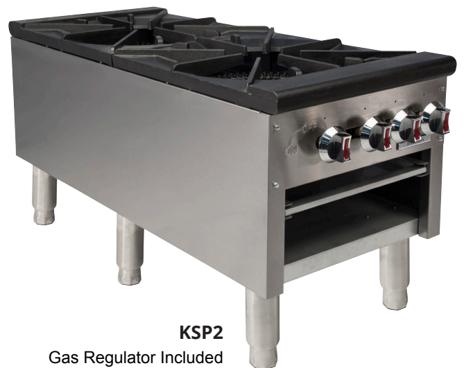
KSP2 Gas Regulator Included

Kintera Gas Cooking Equipment is warranted to be free from defects in material and workmanship under normal use and service for a period of 1 year from the date of original purchase.